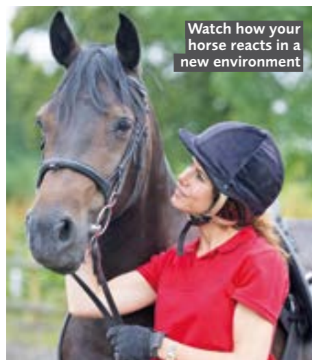
Watch how your horse reacts in a new environment

Take a few easy steps to avoid a yard move being stressful for your horse