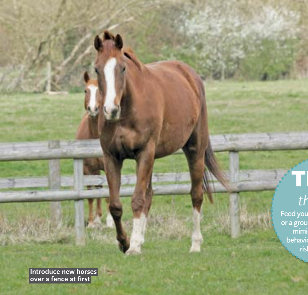
Introduce new horses over a fence at first

calm horse friend and arrange for them to have a few hours turnout in his new field. If they are happy, take them for a walk to explore the area.