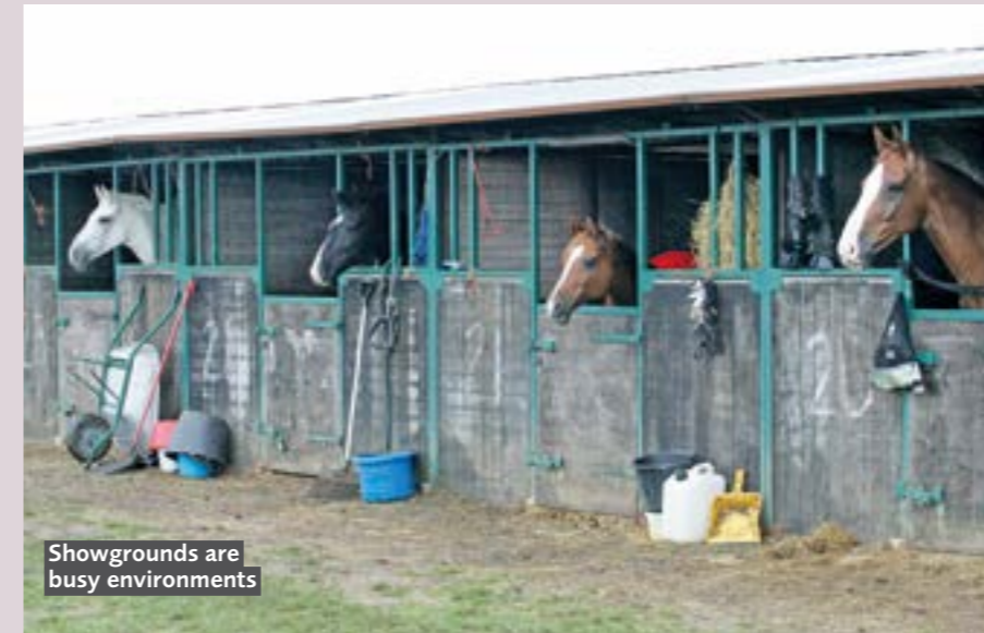
Showgrounds are busy environments

Make sure his forage and feed are placed in an area he feels safe to eat in, and that no other horses can reach his food. ■